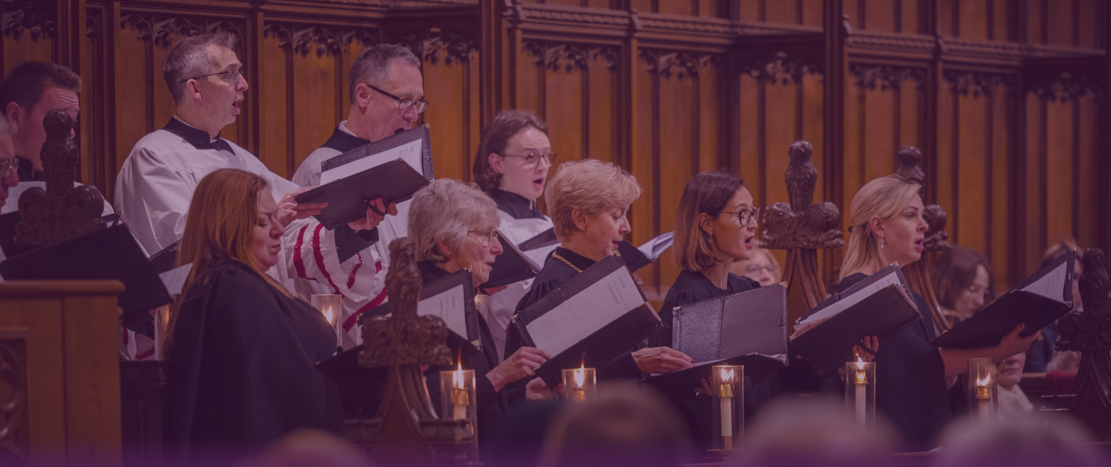
Festival Carol Service, December 2022